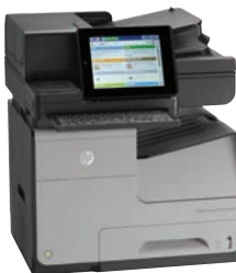
HP Officejet Enterprise Color Flow MFP X585z