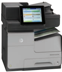
HP Officejet Enterprise Color MFP X585dn

A printing revolution for business. HP Officejet Enterprise MFPs deliver color prints at up to twice the speed and half the cost per page of color lasers plus copy, scan, and fax. 1,2,8 They're designed for advanced workflow—and built to last.