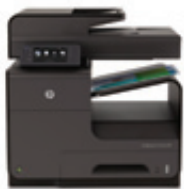
(HP Officejet Pro X476dw color MFP)