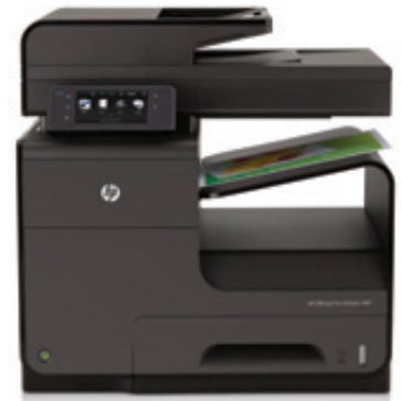
(HP Officejet Pro X576dw color MFP)

The next generation of printing is here. Print professional-quality color—up to twice the speed 1 and half the cost per page of color lasers 2 —using HP PageWide Technology. Help workgroups thrive with versatile functions and easy manageability.