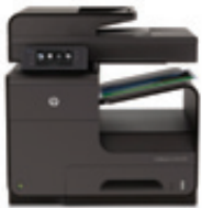
(HP Officejet Pro X476dn color MFP)