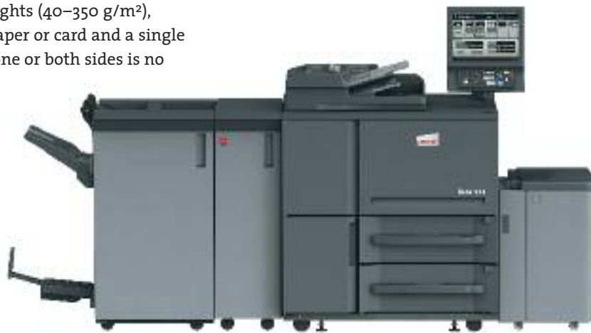
ineo 951 with multi-punch unit, 100-sheet finisher FS-532, saddle stitch unit SD-510 and large capacity paper tray LU-409.