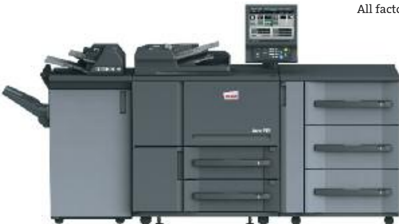
ineo 951 with 100 sheet finisher FS-532, post inserter PI-502 and the paper feed unit PF-706

If you think you've seen everything in digital printing, take a good look at the quality of this machine's printing. Its eye-catching quality is based on a series of innovative technologies, such as precision LED exposure with an impressive resolution of up to 1,200 dpi, sophisticated and ultra stable media handling, and DEVELOP's unique screening technology. These technical innovations work hand in hand with DEVELOP's own ineo toner to deliver consistently excellent digital quality. And the advantage of digital technology is that you can produce even small print runs at a profit. This is especially true with the ineo 951 since it runs economically, scans at high speed, and is easy to operate via a clearly arranged touchscreen. All factors you can build on for business success.