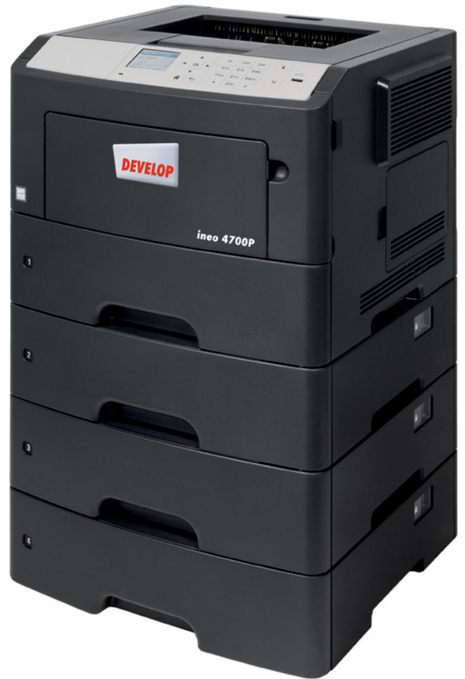
ineo 4700P fitted with three additional PF-P12 paper trays for 2,300-sheet input

Expand your printer's capabilities with one of two Solution Cards (available on ineo 4000P and 4700P only). The UK-Po2 allows users to convert existing data into custom-designed forms capable of containing variable text, images, and barcodes. This Solution Card provides your printer with native support for more than 47-types of industry-standard barcodes. The UK-Po3 provides host-to-printer support in IBM iSeries server environments.