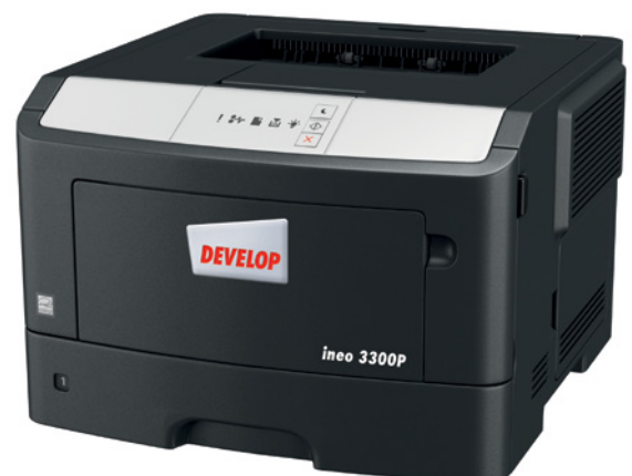
Front view of ineo 3300P as standard