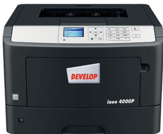
Front view of ineo 4000P as standard

Take advantage of a range of productivity-boosting features. Automatic duplexing is standard across the range for cost-effective two-sided printing. Save on your paper usage with automatic removal of blank pages from your print sets or number-up combination printing for multiple pages on one sheet. Address the needs of your mobile workforce with Direct Print from a USB flash drive (ineo 4700P model only). Protect your confidential prints from unauthorised access with Secure Print - requiring you to authenticate before job output (ineo 4000P and 4700P only). Automatically insert separator sheets, between print-sets or individual pages.